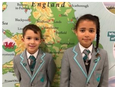
Eco-Schools Ambassadors Y1 & Y2